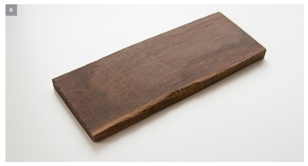
Milan wood keepsake #6: 3 x 7.5 x .375 in.