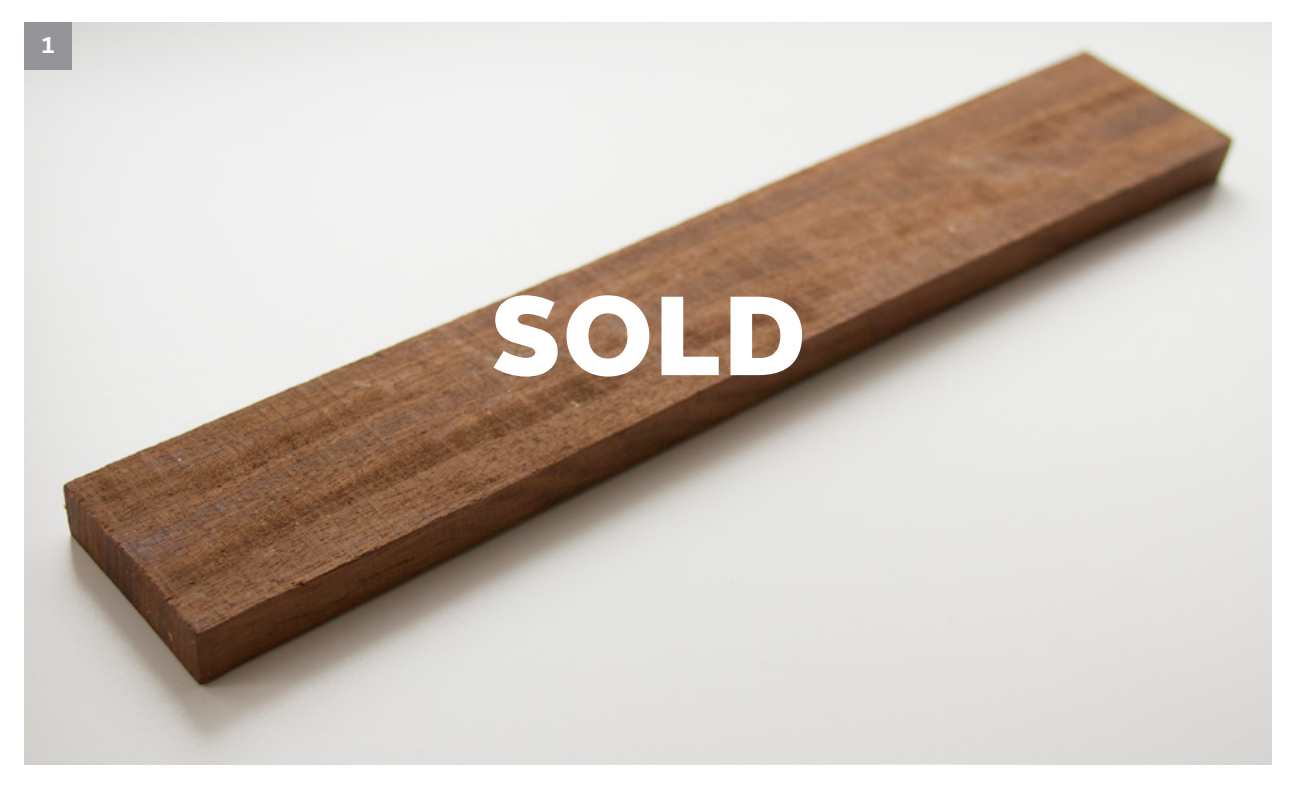
Milan wood keepsake #1: 2.125 x 12.375 x .5 in.

Photos are not actual size but are shown roughly in proportion to each other and are shown blank before the laser etching of the Milan quote.