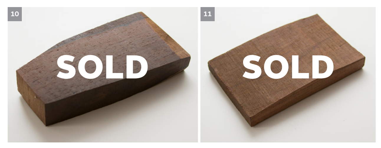
Milan wood keepsake #10: 2.875 x 5.625 x 1 in.