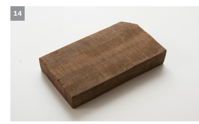
Milan wood keepsake #14: 2 x 3.875 x .625 in.