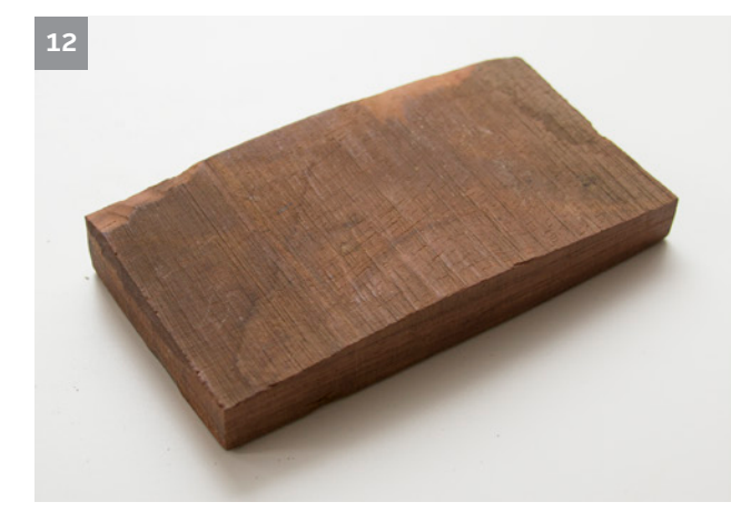
Milan wood keepsake #12: 2.5 x 4.75 x .625 in.