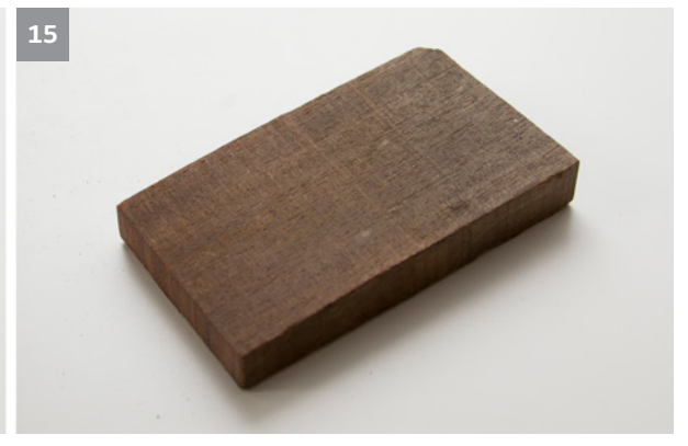
Milan wood keepsake #15: 2.125 x 3.875 x .5 in.