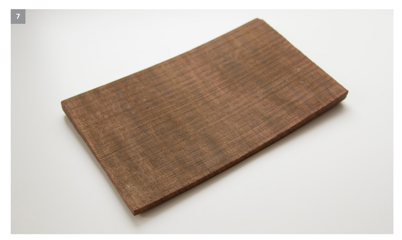
Milan wood keepsake #7: 4.375 x 7.375 x .3125 in.