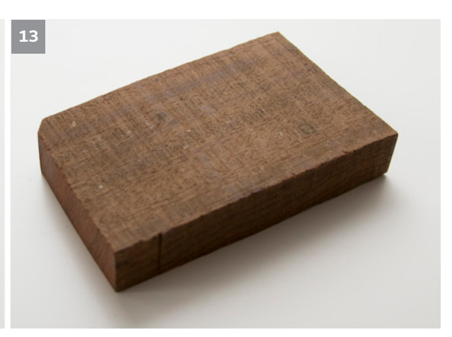
Milan wood keepsake #13: 2.75 x 4.375 x .75 in.