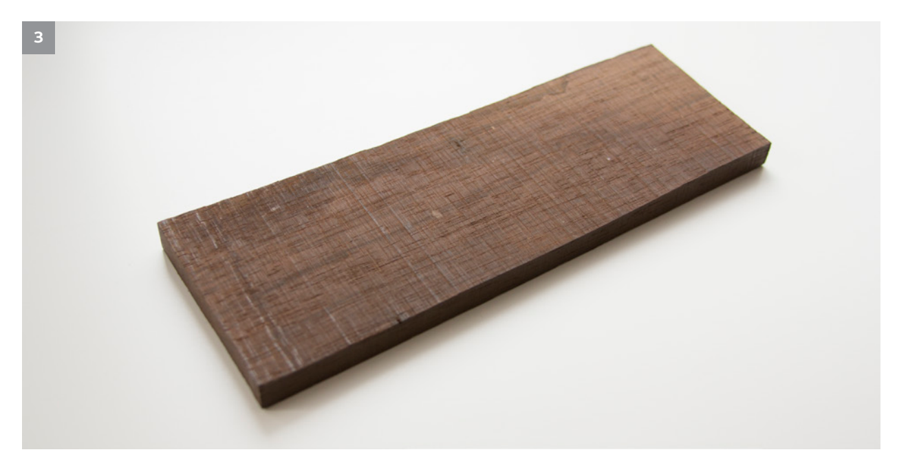
Milan wood keepsake #3: 2.75 x 8 x .375 in.

Milan wood keepsake #2: 1.875 x 9 x .5 in.