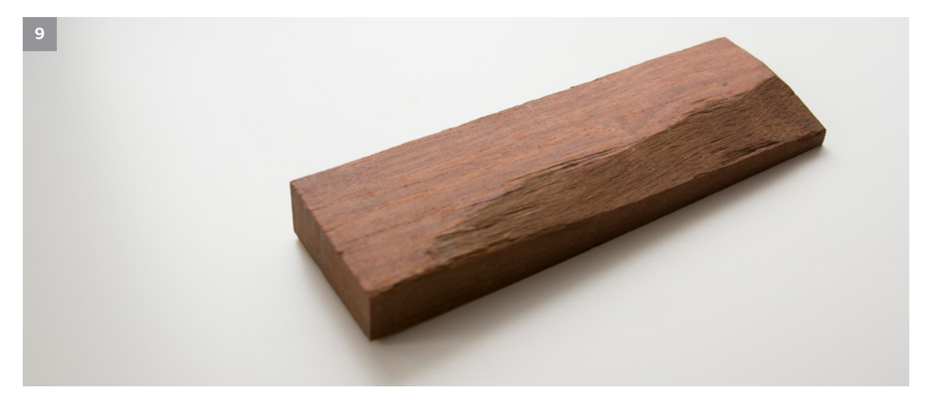
Milan wood keepsake #9: 2 x 6.625 x .5–.75 in.

Milan wood keepsake #8: 3.5 x 7.125 x .375-.75 in.